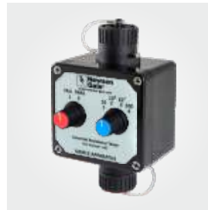
Universal Resistance Tester Product Code: URT.