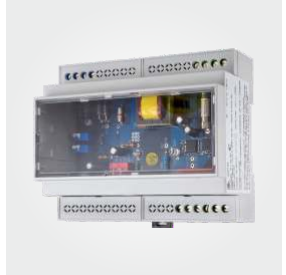
Earth-Rite OMEGA II

Two dry contacts can be used to switch power to additional ground status indicators or interlock with the process to shutdown product transfer when the OMEGA II detects an open circuit on the path to ground.